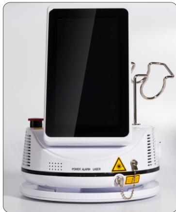
7 inch touch screen

INSTRUMEDIC launch its second generation dental laser CHEESEII for the dental market in May, 2015, the max output power is 7w, 810nm or 10w, 940nm/ 980nm, there is a big color touch screen, wireless foot switch and customizable pre-setting protocols. As it is becoming more competitive in the dental laser market, our new CHEESEII laser system will offer our partners, dentists and hygienists an effective but affordable unit for their practice.