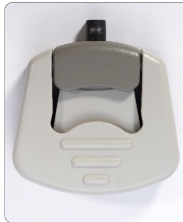
Wireless foot switch